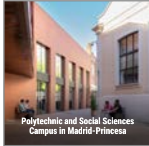
Polytechnic and Social Sciences Campus in Madrid-Princesa