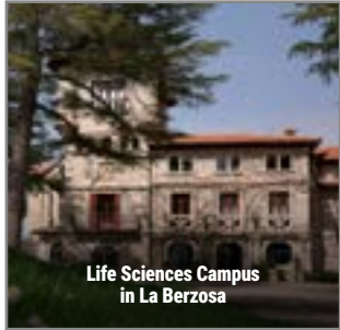
Life Sciences Campus in La Berzosa