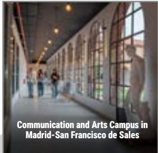
Communication and Arts Campus in Madrid-San Francisco de Sales