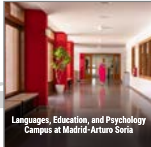
Languages, Education, and Psychology Campus at Madrid-Arturo Soria